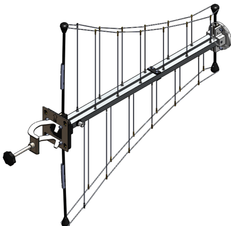
Showing mounting on LPDA-A0076