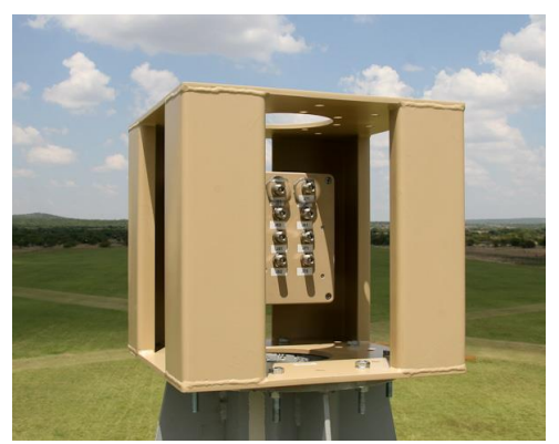
Also showing installed MISC-A0045