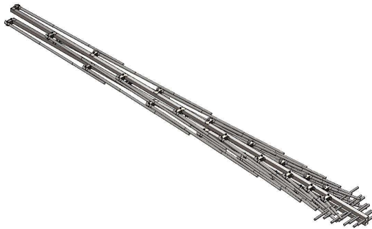
Figure 2: Full Antenna in stowed configuration