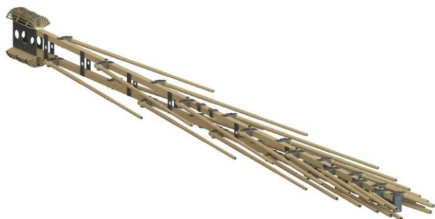
Figure 2: Antenna in stowed configuration